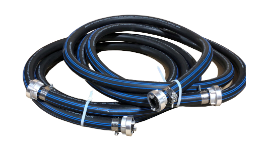
Hose Set Recirc Hose