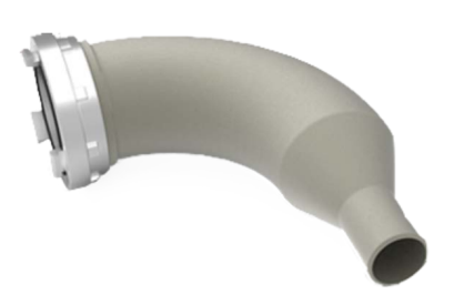
45° and 90° Nozzles