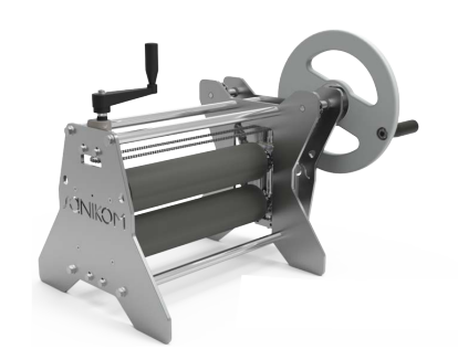
Wet Out Roller