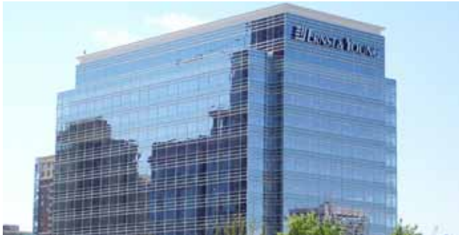
55 Allen Plaza, Atlanta, USA

The below grade walls were built from the top down, rather than digging down, using single-sided forming against the dirt. The developer used KIM to waterproof because the shoring wall didn't leave room for installing conventional membranes.