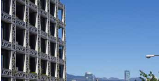
700 West 8 th Vancouver, BC, Canada

KIM was added to the shotcrete mix used to tank over 700 cubic meters of concrete perimeter walls.