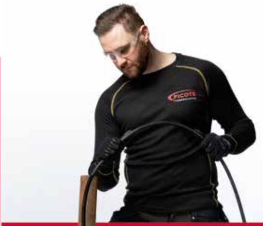
Cleaning and cutting through 2" P-Traps