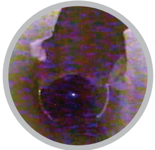
Broken / Missing Pipe