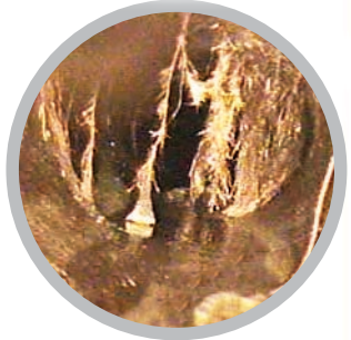
Tree Roots Filling Pipe