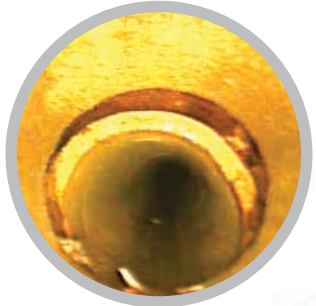
Separated / Offset Pipe